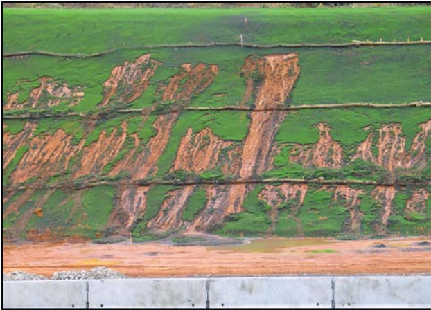
Figure 1.4 – Steep slopes are often difficult to revegetate and many past attempts at roadside revegetation did not succeed. Inexpensive and readily-available exotic plants either failed to establish or became weeds. Integration of revegetation techniques into road planning and implementation increases the chances of success.

ic weeds, or failed to persist because they were not locally appropriate species. Once established, exotics may preclude reintroduction of desirable natives. In other cases, little consideration was given to establishing roadside vegetation during or after construction; if vegetation was considered, it was often as an afterthought. A short-term approach to revegetating roadside disturbances often predominated past efforts, while efforts toward long-term development of native plant communities did not receive adequate consideration. The ineffectiveness of revegetation efforts in the past has resulted in such problems as erosion and sediment loading, affecting soil and water quality. Visually, unvegetated road disturbances diminish the experience of the road user and economically translate to high costs associated with ongoing maintenance.