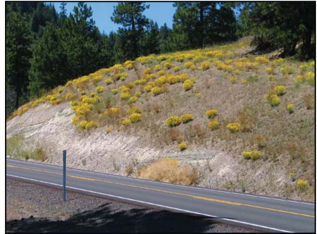
Figure 1.7 – “Roadside” refers to disturbed areas resulting from road construction, modification, or improper maintenance.

the edge of the road surface, depending on the project. In some situations, revegetation efforts may encompass areas beyond the ROW that are affected by or affect the road. The area where the revegetation specialists will be focusing their efforts is usually dependent on two factors: ownership of the ROW and surrounding lands, and areas of disturbance (construction footprint). Most roadsides represent drastically disturbed environments, where soil may be severely compacted and consist of a mixture of subsoil and parent material. Beneficial microorganisms, nutrients, and organic matter necessary to sustain plant growth may be absent or severely depleted. Often, slopes can be very steep and inaccessible, exposed to the erosive effects of wind and water. These environments represent a revegetation challenge of high intensity and magnitude.