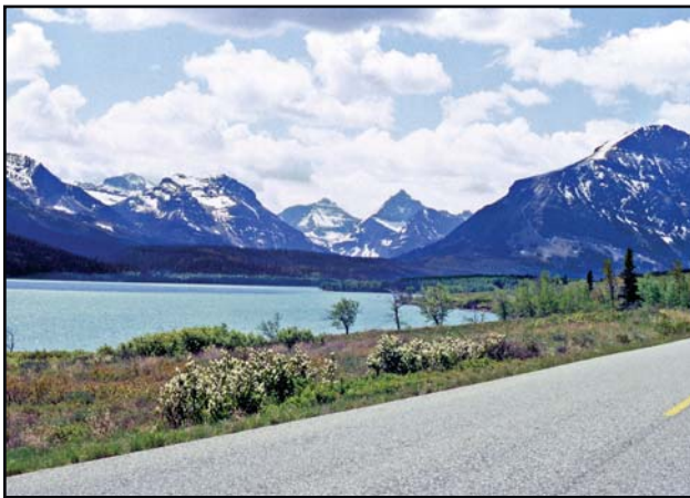
Figure 1.10 – Native roadside revegetation in Glacier National Park. Photo by Tara Luna.

Balancing ecological health with safe and efficient transportation is an enormous challenge. Protecting existing native vegetation during construction and establishing native plants on roadsides following disturbance is key to integrating road systems into natural systems. To protect environmental health and sustain the native plant communities of roadsides, conservation and revegetation efforts must be an integral part of road design and construction. The process of roadside revegetation requires communication, interdisciplinary practice, and interagency cooperation. This report guides the reader through a comprehensive process for initiating, planning, implementing, and monitoring a project in order to successfully establish and perpetuate native plant communities on roadsides. It is hoped that this report will advance the science and technology of this field and lead practitioners to more successful projects.