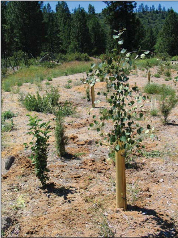
Figure 1.3 - Most road projects today do not involve building new roads, but rather modifying or obliterating existing roads. This photo shows recently planted trees on an obliterated section of highway in Oregon.

as the nation's roads are being updated and modified, the opportunity cannot be ignored. While attempts to integrate ecological factors are positive, much of the potential for improved integration is still largely unrealized. This has been due, in part, to a shortage of practical information and the absence of an integrated approach to the challenge. The question is, what can be done to balance societal desires for safe, efficient transport with requirements for a healthy environment? In other words, what can be done to help roads systems function better with natural systems?