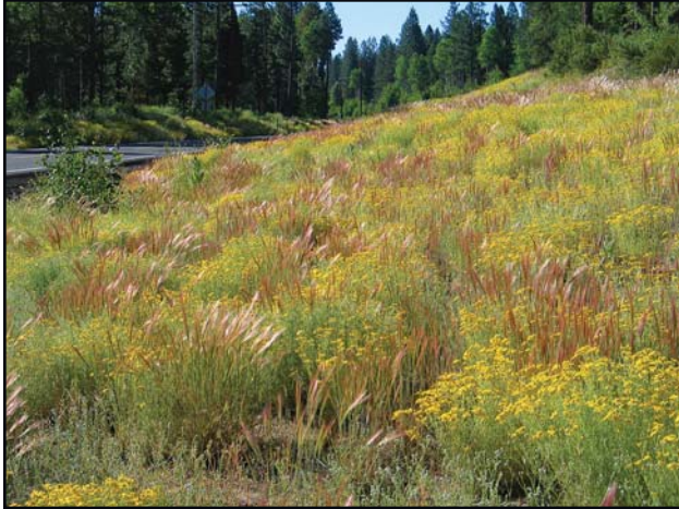
Figure 1.6 - The establishment of native plant communities is the cornerstone of ecological restoration.

While restoring plant communities to a pre-disturbance state is not a goal (or even a feasible idea) on highly disturbed roadsides, each of the above three ecosystem aspects can be improved with appropriate roadside revegetation practices. Establishing reference sites, or natural models for the desired recovery process, is key to identifying and overcoming limiting factors and accelerating succession by establishing native plants.