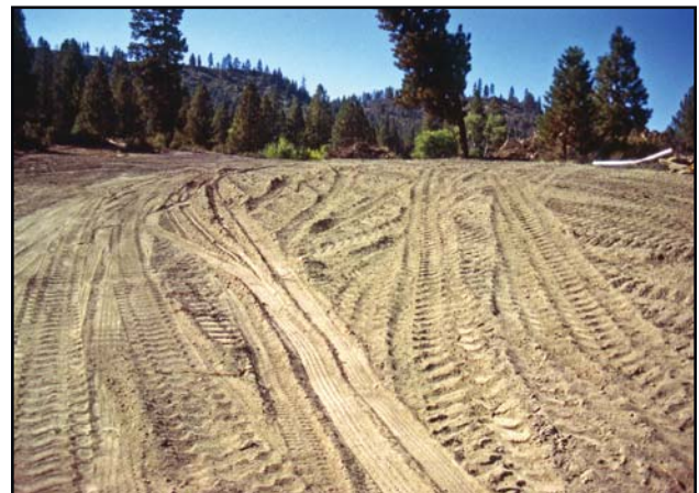
Figure 1.8 - Roadsides are drastically disturbed and infertile environments with no topsoil, severe compaction, and a lack of beneficial microorganisms. They include obliterated roads and borrow sites as shown in this photograph.

The approach integrates multiple disciplines and the efforts of multiple agencies and participants from both private and public sectors in a comprehensive