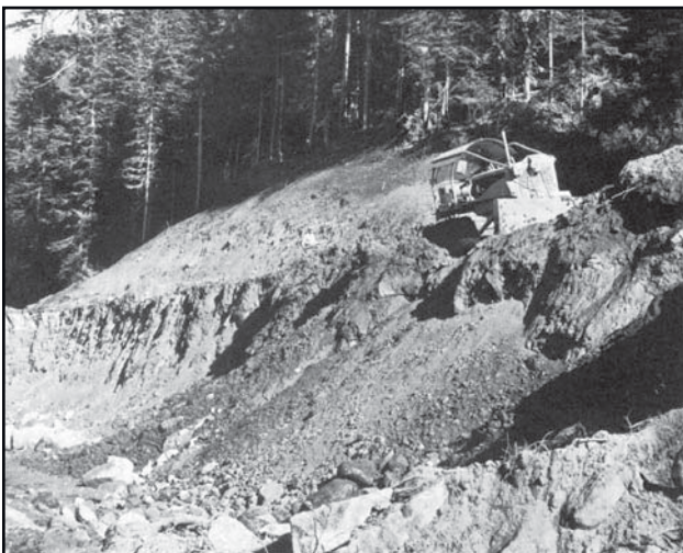
Figure 1.2 – Most existing roads were constructed prior to 1970, before ecological health became a widespread concern.