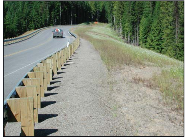
Figure 1.5 - Past shortcomings can often be attributed to a lack of an integrated approach and proper coordination. This photo shows an area recently revegetated with native plants that has been sprayed with herbicide.